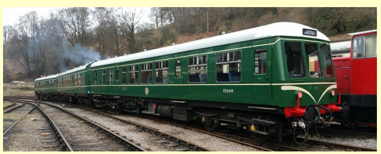
E50619 departing Norchard, 19/3/16 (C.Walker)