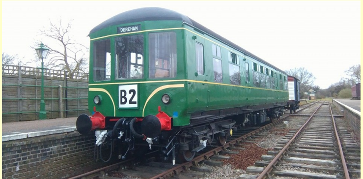
Class 100 sporting an alternative route indicator at County School, 19/3/16 (C.Moxon)