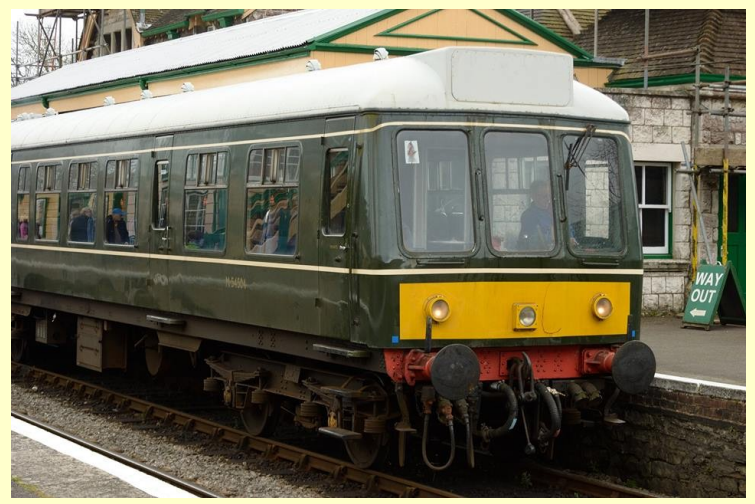
Class 108 M54504 pauses at Corfe Castle, 7/4/16