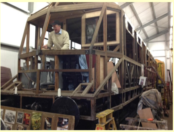
GWR Railcar W20 under restoration, 10/4/16